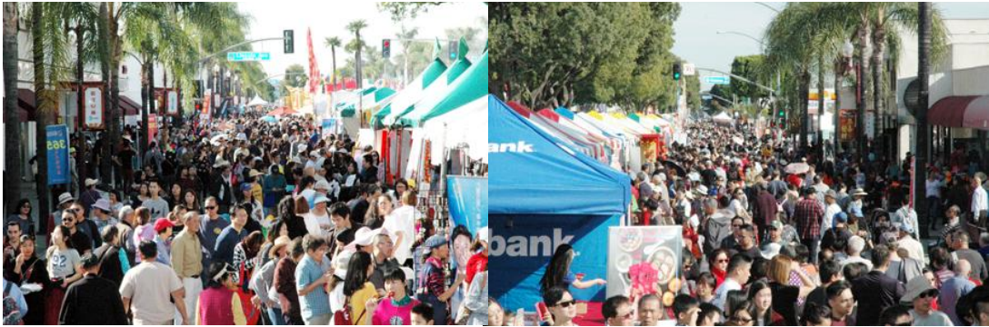
Photo Gallery of Lunar New Year Festival