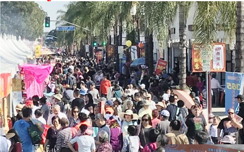
Photo Gallery of Lunar New Year Festival