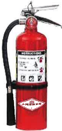
2A:10 B:C portable fire extinguisher