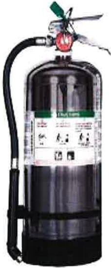
Class K fire extinguisher