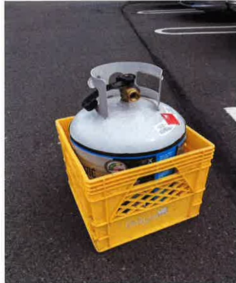
Crate for propane tank