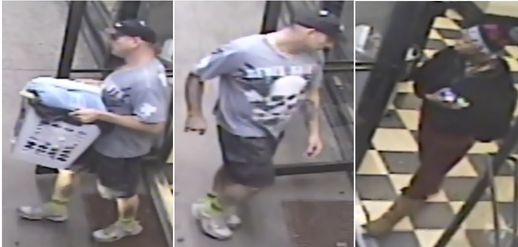
Subject seen driving the vehicle